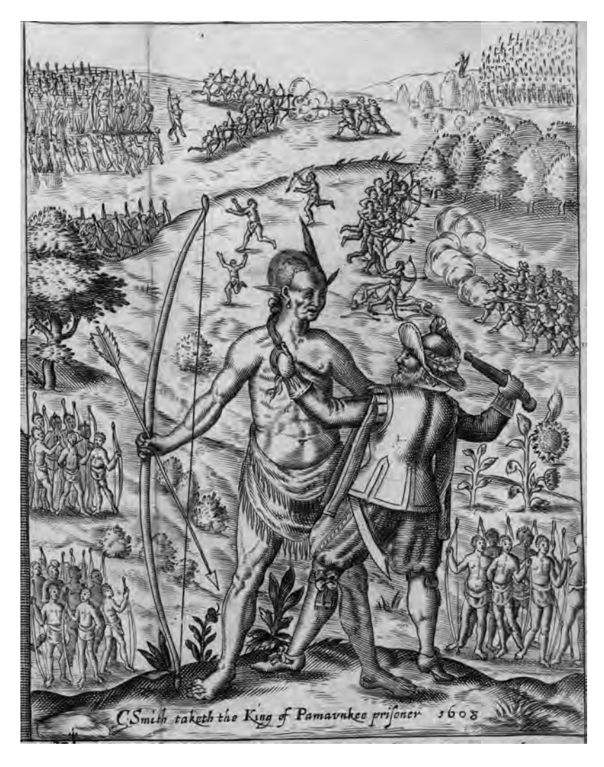
Detail from a map entitled "A description of part of the adventures of Cap: Smith in Virginia," from John Smith's The generall historie of Virginia, New England, and the Summer Isles (London, 1624).

As always, the words we commonly use make an immense difference. It was a shock to many readers in 1975, for example, when Francis Jennings published a book about the New England Puritans and other seventeenth-century English "settlers" entitled The Invasion of America . Did the Europeans invade Massachusetts? The Span-